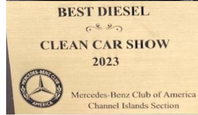
Alex Valtchev – 1985 300D