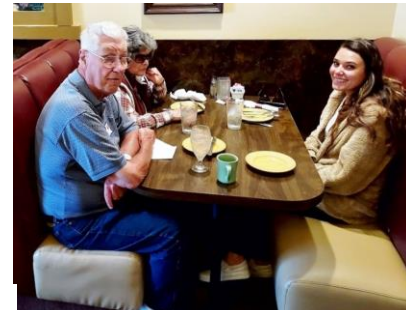
↑ You can never be too young, or too (ahem) mature , to enjoy club events